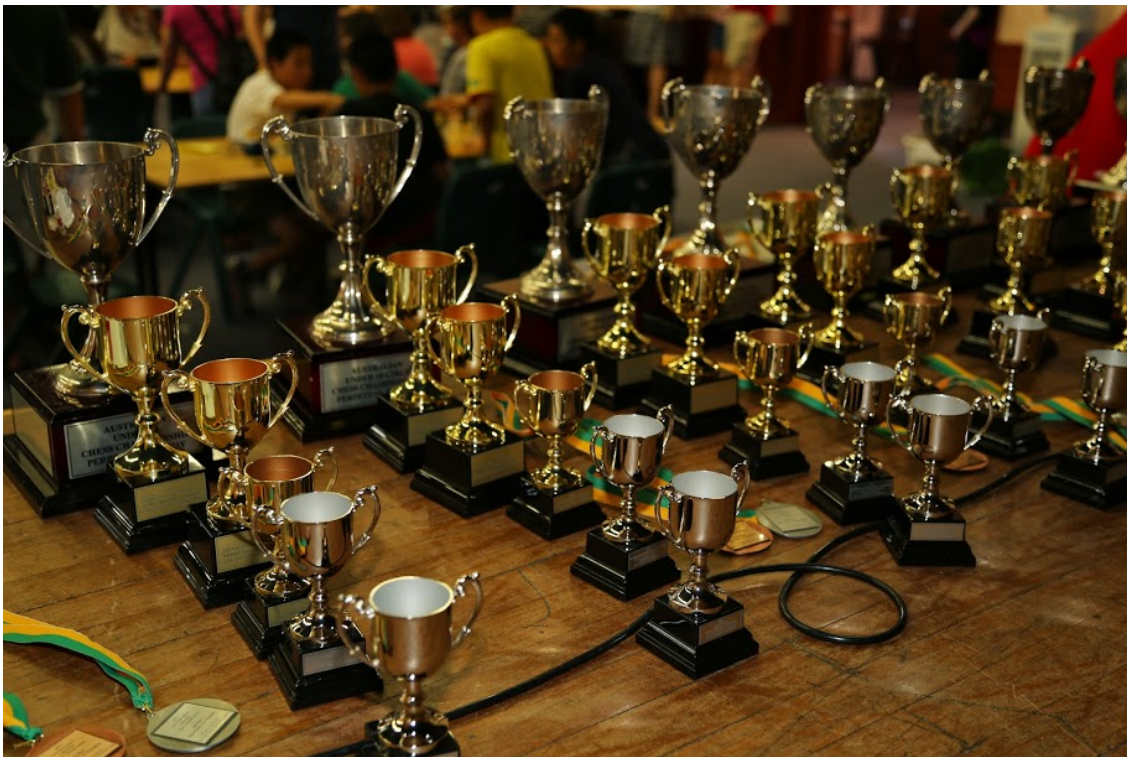
With plenty of great trophies up for grabs, it was no wonder competition was fierce.