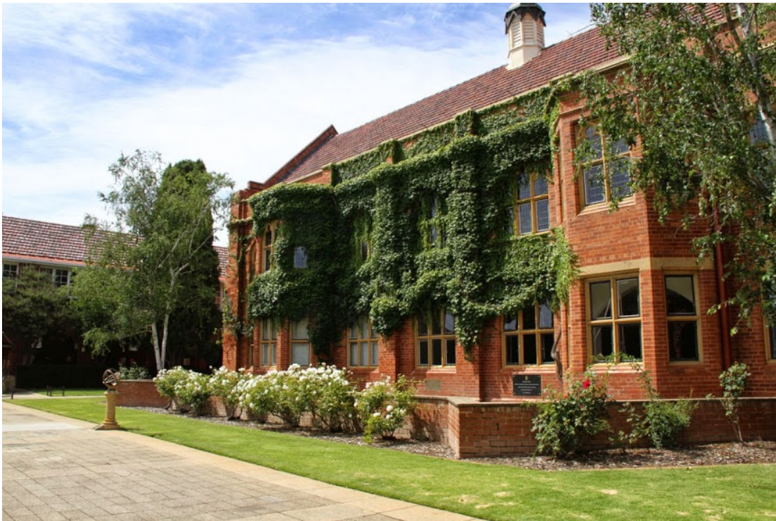
The tournament was held on the beautiful grounds of the Canberra Grammar School in Red Hill.